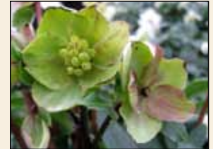
Thrips damage (on right)