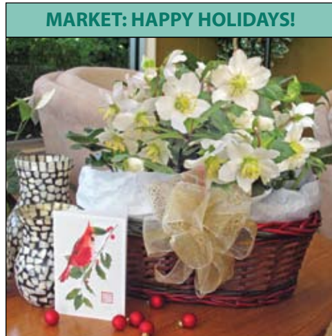
MARKET: HAPPY HOLIDAYS!

OBJECTIVE: florist quality, blooming plant to enjoy indoors, then out USES: hostess gift; indoor, seasonal color; outdoor plant SALES WINDOW: late November–December CULTIVARS: Jacob MARKET SEGMENT: florists, grocery stores, independent garden centers, mass merchants RETAILER BENEFITS: higher margin crop; suitable for creating indoor merchandizing displays; cross-sales with Christmas cactuses, cyclamen and poinsettias