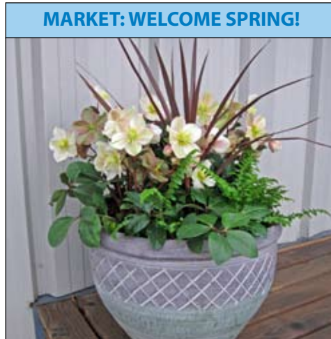
MARKET: WELCOME SPRING!

OBJECTIVE: florist quality, blooming plant to enjoy indoors, then out USES: hostess gift; indoor, seasonal color; outdoor plant SALES WINDOW: late November–December CULTIVARS: Jacob MARKET SEGMENT: florists, grocery stores, independent garden centers, mass merchants RETAILER BENEFITS: higher margin crop; suitable for creating indoor merchandizing displays; cross-sales with Christmas cactuses, cyclamen and poinsettias