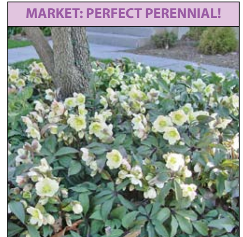
MARKET: PERFECT PERENNIAL!

OBJECTIVE: natural-season, blooming plant for frost-hardy patio containers and the garden USES: frost tolerant patio containers SALES WINDOW: December–April CULTIVARS: Champion, Cinnamon Snow, Josef Lemper, Pink Frost, Spring Breeze, Spring Party MARKET SEGMENT: grocery stores, independent garden centers, mass merchants RETAILER BENEFITS: higher margin crop; suitable for merchandising displays; cross-sales with early spring bulbs, pansies and primroses